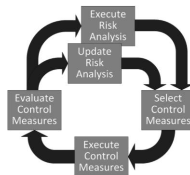
Fig. 1 Risk management, a cyclic process.

3 ribs Space Consultancy & Insurance / Data Banking & Control, 1984 – 2008.